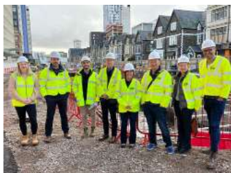
Having an early view of the Dock Feeder Canal which is set to be reopened.