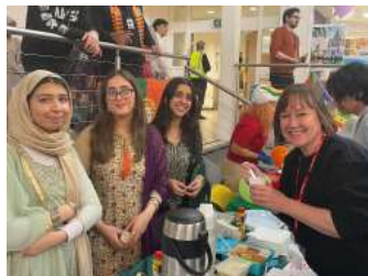
Celebrating St David's College's cultural diversity day