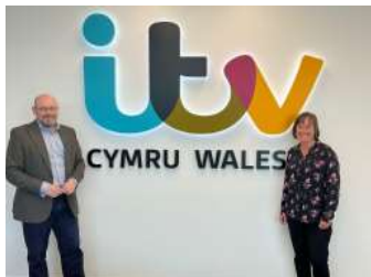
Meeting the ITV Wales News Team