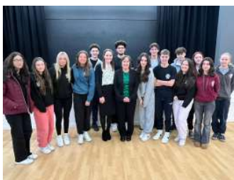
Taking questions from A-Level Students at Cardiff High School.