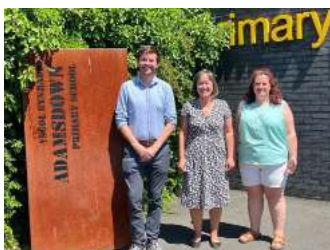
Celebrating a positive Estyn Report at Adamsdown Primary School.