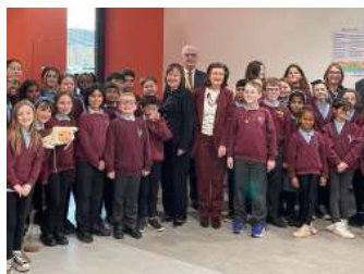
Listening to St Philip-Evans R.C Primary School Choir at the Maelfa Wellbeing hub launch.