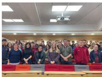
Welcoming Cardiff University Students to Cardiff Central.