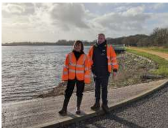
Inspecting progress ahead of the reopening Llanishen Reservoir.