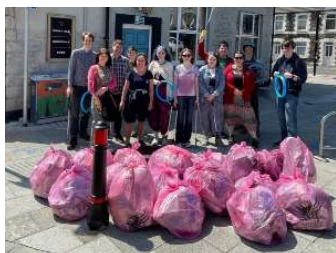
Joining Cardiff Labour Students to keep Cathays tidy.