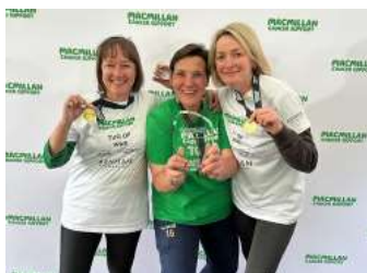
Winners of the House of Commons v Lords Tug of War.