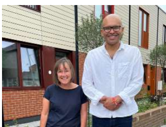
Visiting new sustainable council homes on Crofts Street.