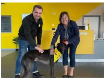
Visiting the new Dogs Trust Charity Centre.